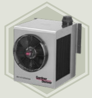
MH & MH-C2 Series Hydraulic Drive Cooling Systems