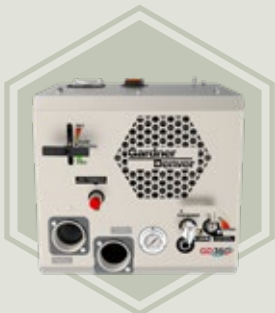
GD360 All-In-One Liquid Bulk Package

B&R Repair is an authorized distributor of Gardner-Denver pumps, blowers, vacuums and cooling systems specifically designed to meet all dry bulk, chemical, hydraulic and sanitary equipment needs.