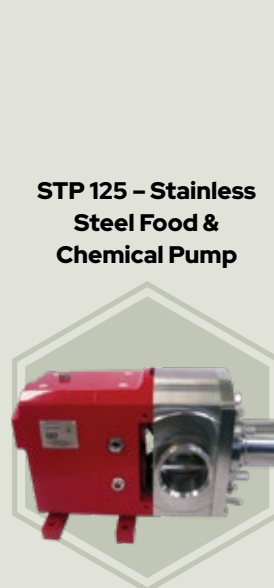
STP 125 - Stainless Steel Food & Chemical Pump