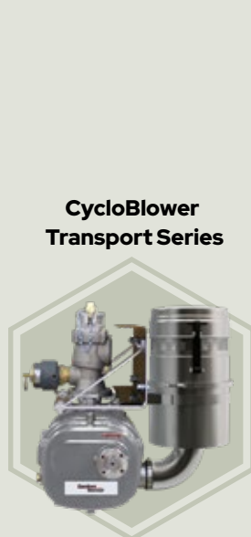
CycloBlower Transport Series