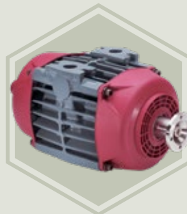
Drum GD150/GD175 Radial Vane Compressor